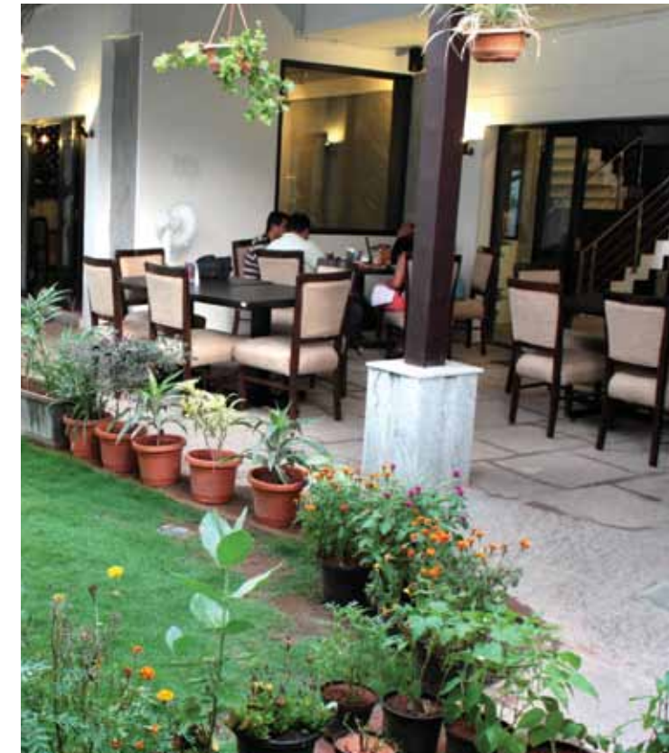
The Fat Chef: This cafe-restaurant reflects all that is Jagriti: fresh, vibrant, and focused on serving you better.