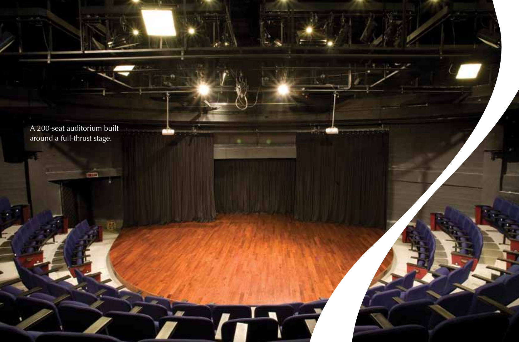
A 200-seat auditorium built around a full-thrust stage.