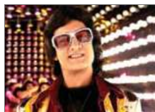
What was trending in Bollywood this year